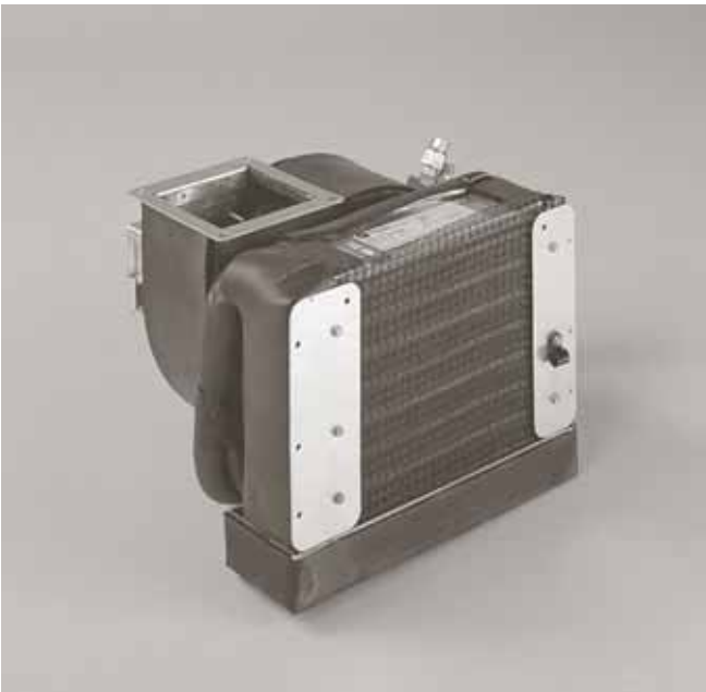
EBU7 Unit Shown