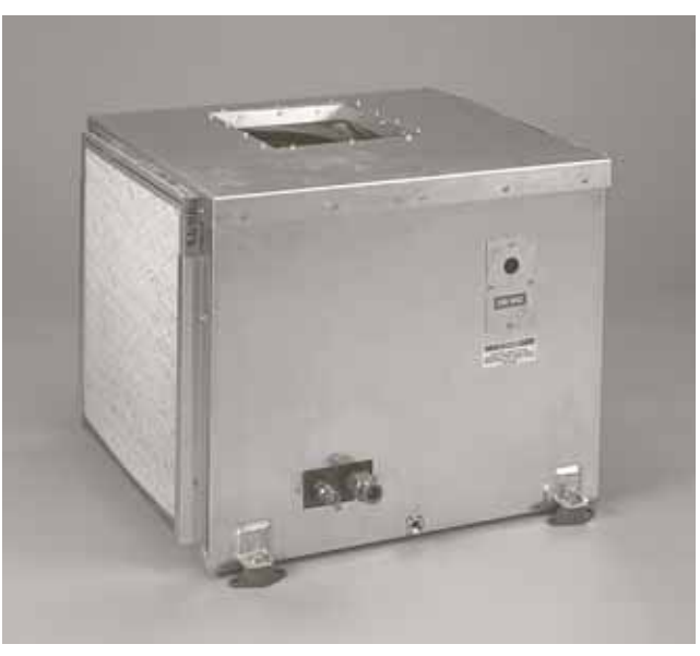
EBD Unit Shown