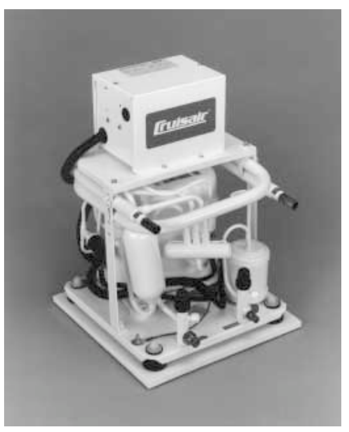
J10 Condensing Unit Shown