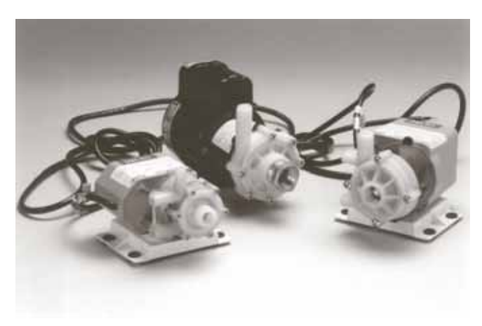
PMP250, PMA1000 & PMP500 Seawater Pumps Shown

pumps to provide a steady flow of cooling water through the air conditioning system.