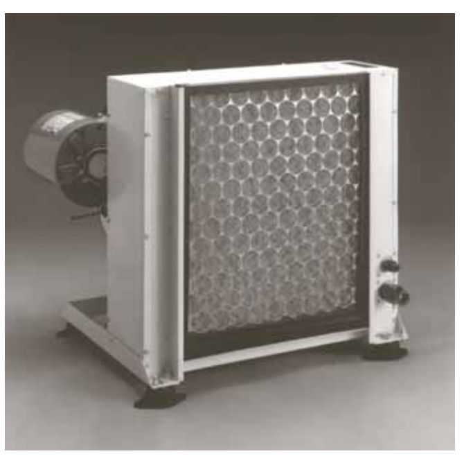
EBOH30C Cooling Unit Shown