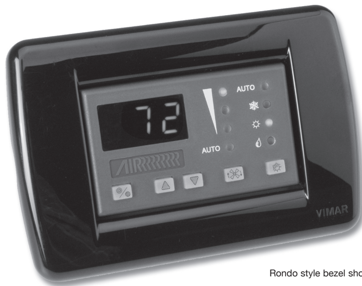
Rondo style bezel shown