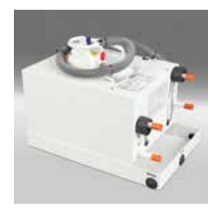
Extended drain pan collects and removes condensate that drips from water connections.