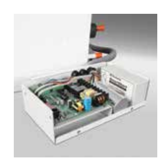
The electrical box has space for the optional SmartStart soft starter.