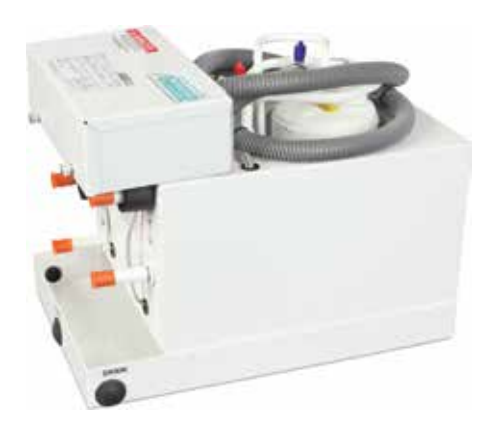
CHCG20Z shown with the electrical box mounted to the top (standard).

Marine Air's Chiller Compact series is ideal for larger boats in the 45-70 ft. (15-20 m) range. Available in capacities of 16,000 and 20,000 BTU/hr, the Chiller Compact uses circulated water in a closed loop in place of copper refrigerant tubes. The innovative, space-saving compact base of the Chiller Compact was designed to allow individual modules to be multiplexed to provide precise capacity requirements for any application.