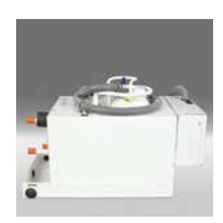
The electrical box can be mounted on the rear of the unit for better installation flexibility.

The electrical box comes installed on top of the unit. However, it has a short harness and hardware allowing the installer to easily move it to the rear of the unit if desired.