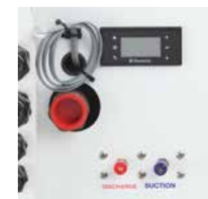
Integrated digital chiller control/display.