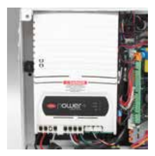
Built-in variable frequency drive.

An optional high-resolution color touchscreen provides a dynamic interface and improved system metrics and control. Access detailed, complex system information from a single location and interact accordingly.