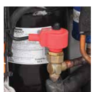
Electronic expansion valve for precise control of superheat.